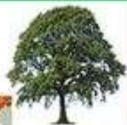
An oak tree