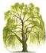
A weeping willow